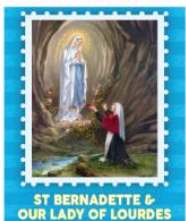
ST BERNADETTE & OUR LADY OF LOURDES