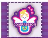
Virtue #5: Compassion