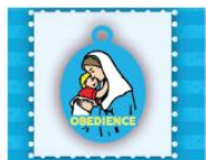
Virtue #1: Obedience