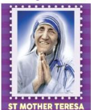
ST MOTHER TERESA