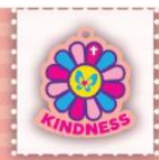
Virtue #2: Kindness