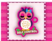
Virtue #4: Self Control