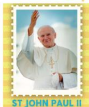
ST JOHN PAUL II