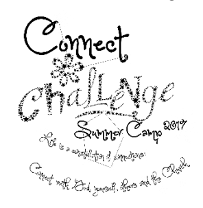
Challenge Camp CONNECT Black and White with Tagline