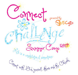
Challenge Camp CONNECT Full Color with Tagline & Clear Background