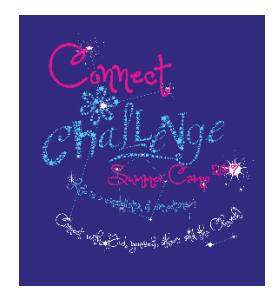
Challenge Camp CONNECT Full Color with no Tagline & ECYD