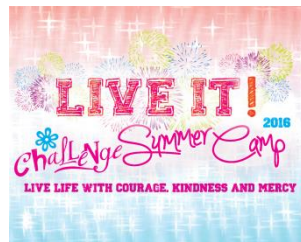
Challenge Camp LIVE IT Full Color with Tagline & Background & ECYD